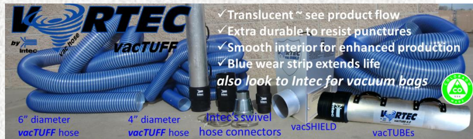
6" diameter vacTUFF hose